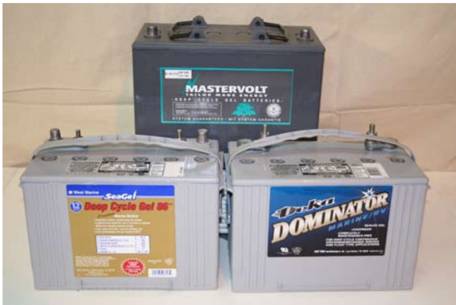
The three gel cells in our test were the Mastervolt MVG 12/85, the West Marine SeaGel, and the Deka Dominator.

motion that causes a handle to dislodge, which would be similar to the motion exhibited when trying to wrestle a battery out of a battery box. As soon as you twist the battery into place, the handle will flex and disengage from the case.