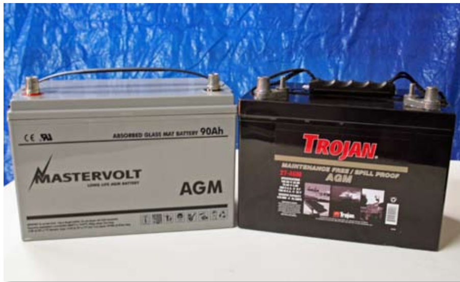
The top performing AGM batteries in our test were the Group 31 size Mastervolt ($213) and Group 27 size Trojan ($169).

It is not recommended to discharge your deep-cycle battery below a 50-percent depth of discharge, which is half of your battery's reserve capacity rating. Each time a deep-cycle battery is discharged 100 percent, the battery will lose at