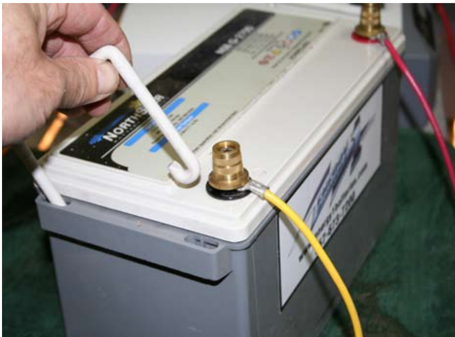
The Energy 1's carrying handles detach from the case too easily.

Optima's low self-discharge rate. This would be extremely beneficial when the vessel is set on a mooring for extended periods of time.